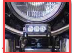
Optional Model RBKTHD5, under headlight mounting bracket kit for one TIR3, LIN3 or LINZ6 horizontal mount lighthead