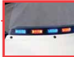
Optional Model M052J, LINZ6 motorcycle windshield light array