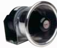
Optional SA350MH Speaker