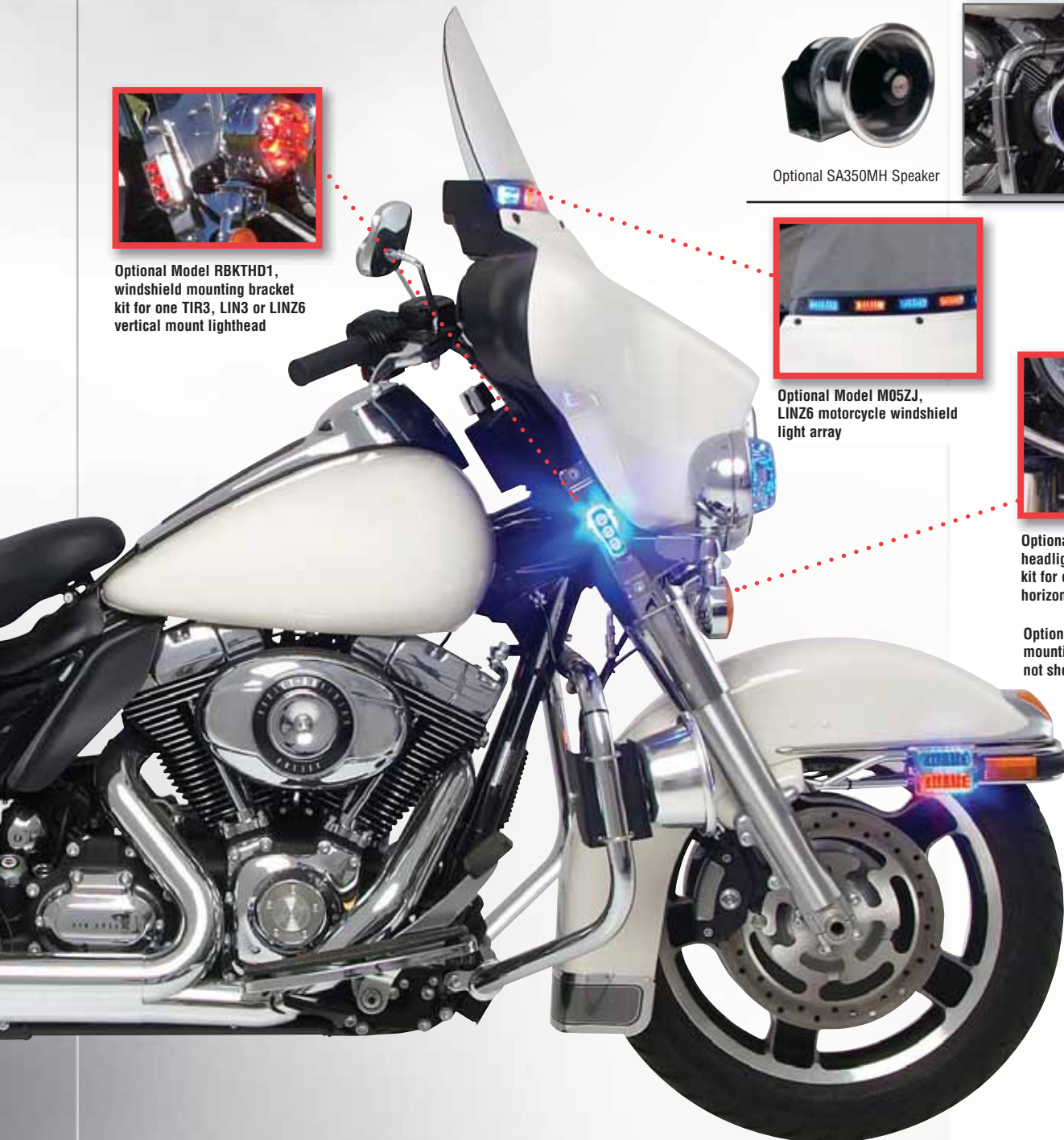
Optional Model RBKTHD6, mounting kit for fog light, not shown