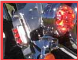
Optional Model RBKTHD1, windshield mounting bracket kit for one TIR3, LIN3 or LINZ6 vertical mount lighthead