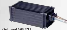
Optional WS321 Siren Amplifier

All LEDs are available in red, blue, amber and white.