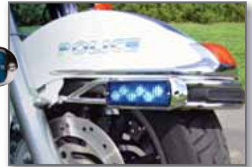
Optional 500 Series TIR6 Super-LED