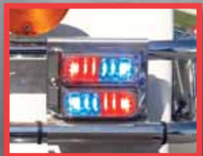
Optional Model RBKTHD3 , rear saddle bag crash bar mounting bracket kit for two TIR3, LIN3 or LINZ6 horizontal mount lighthoods