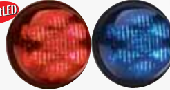
Optional 4" Round TIR6 Super-LED with extended lens